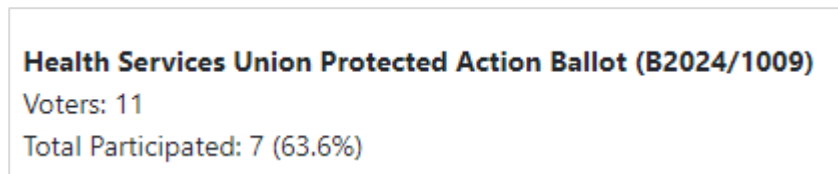
Diagram 1: Final Vote Participation

Final Ballot Audit: Friday, 23 August 2024 at 01.05 pm AWST